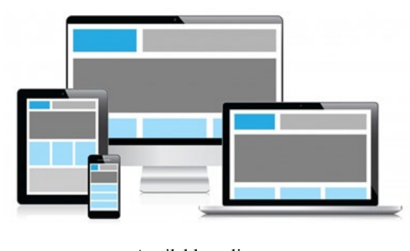
Available online at: www.ssa.gov/myaccount/

Our goal is to deliver services effectively to the public. We continuously evaluate our policies and business processes using data and modern methods to ensure we meet service demands and reinforce efficient and effective service. We recognized our technology infrastructure and existing business systems did not allow us to serve the public the way we want or the way they expect. In response, we developed and updated a plan to modernize our information technology (IT) systems. This multi-year modernization effort is fundamental to our overall ability to improve service to the public.